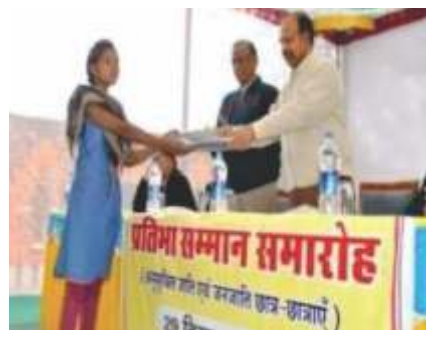
Pratibha Samman Merit Scholarship for SC/ST Students