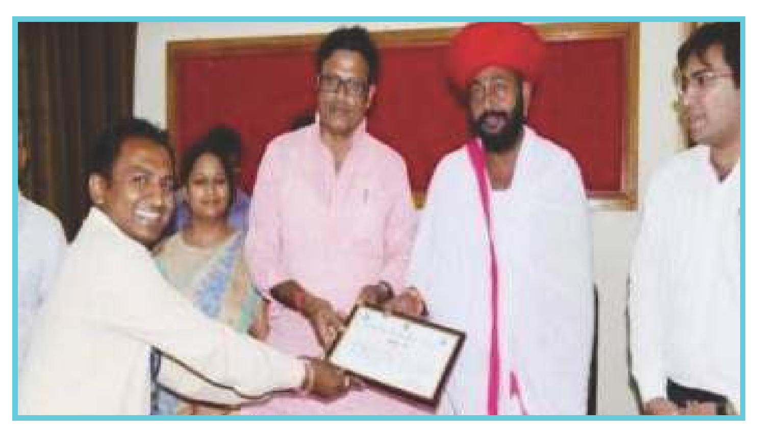
JK Lakshmi Cement Was Recognized by District Administration for Construction of Mini Percolation Tanks Under Mukhyamantri Jal Swavlamban Yojana