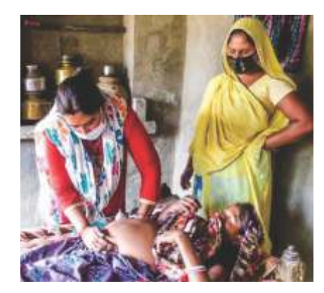
Project ANM visits home to provide care to beneficiaries