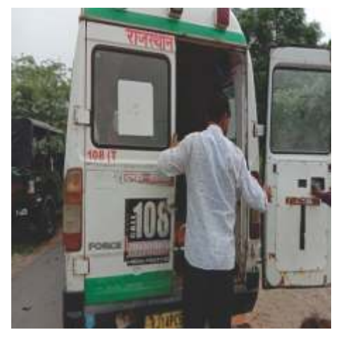
Called 108 Ambulance