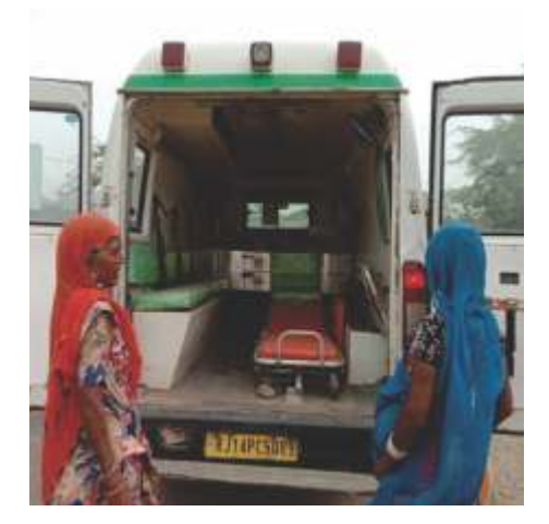
Referral to Government Hospital, Pindwara