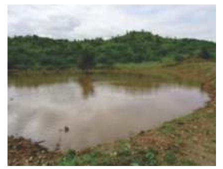
Construction of mini percolation tank & anicut