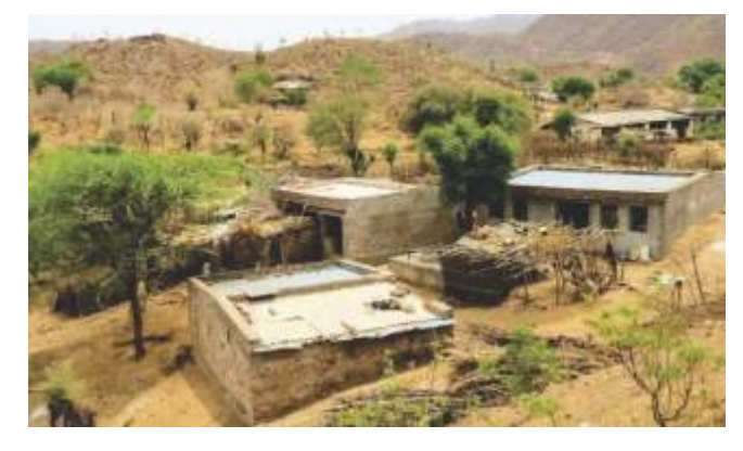
Project area is spread out with dispersed hamlets