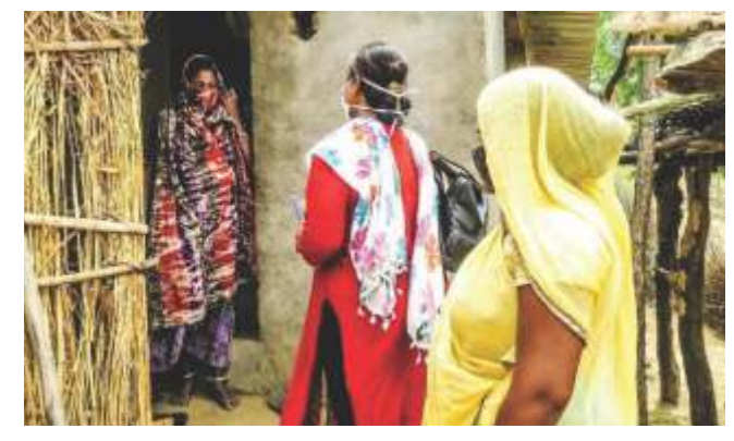
Antenatal & postnatal care is provided by home visit of VLM and \ensuremath{\mathsf{ANM}}