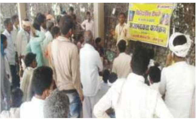
Awareness program on Silicosis in the community