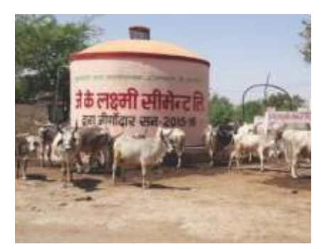
Construction of drinking water tanks for animals (Oru)