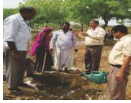
Plantation in community and near government schools