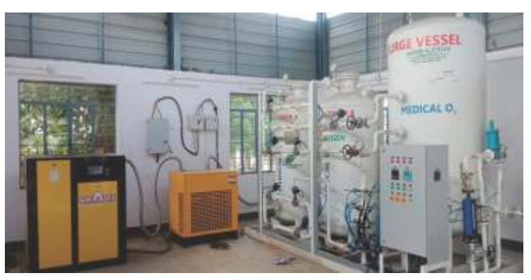
Oxygen plant set up at CHC, Pindwara

To mitigate the effect of Covid-19 pandemic in the community.