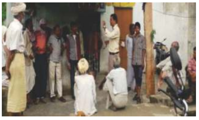
Awareness program on Silicosis in the community