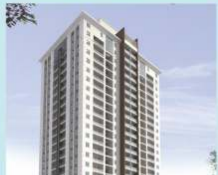
High Rise Buildings