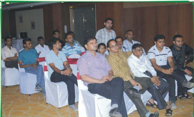
Dealers engrossed in an interactive session at the Bharuch Dealer Meet

JK Lakshmi Cement organised its Annual Dealer Meet to acknowledge the diligent efforts of the dealers and to share their thoughts in Gujarat. The meet was held in Vadodara on 26th June 2012 and later in Bharuch on 31st August 2012.