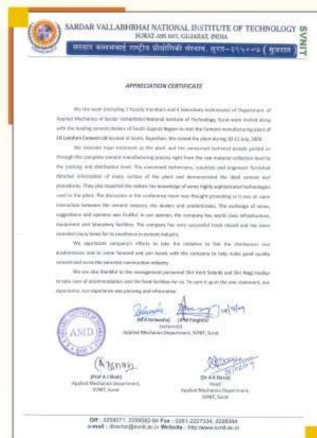
Sardar Vallabhbhai National Institute of Technology Appreciation Certificate

JK Lakshmi Cement was successful in its efforts to link the distributors and academicians and organized brief discussions after the visit to engage the visitors with team JK Lakshmi. The discussion was thought provoking as it was an open interaction between the cement industry, dealers and academicians. The visitors appreciated the firm's efforts to make good quality cement and serve the concrete construction industry.