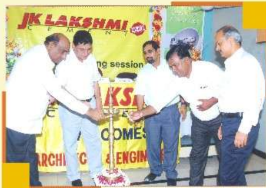
Lamp being lit to start of Knowledge Sharing Session

An interactive session among the participants served the purpose of clearing doubts on the topic as well as an open dialogue. Such sessions are extremely important as it helps JK Lakshmi Cement keep in touch with the members of its extended family. The mood of the session can be summed up in a remark made by a participant in the session that such ongoing efforts has made JK Lakshmi a right choice for everyone.