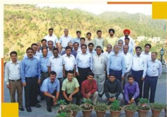
Team JK Lakshmi-North Region along with business partners at the Marketing Conference

The Director's Running Trophy for excellence in sales was presented to the JK Lakshmiplast (Plaster of Paris) team for the commendable growth achieved by them.