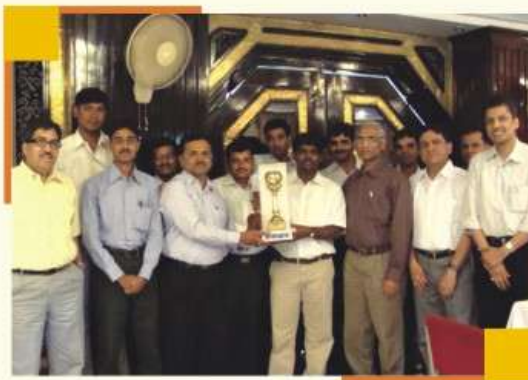
Winning team of Vadodara region with the Director's Running Trophy for excellent sales performance