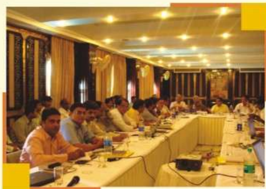
Marketing review of Gujarat taking place at Mt Abu