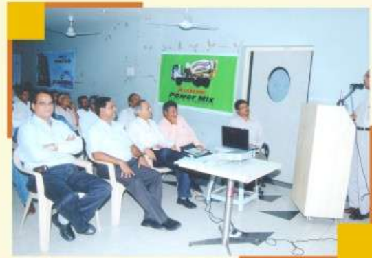
Leading Architects & Engineers at the Session