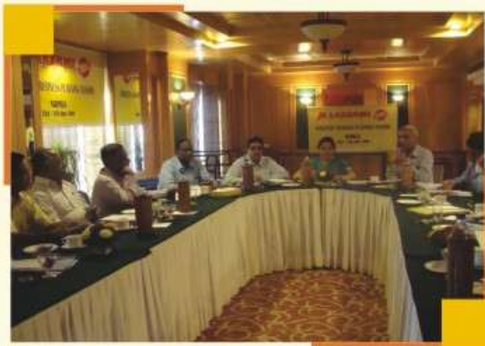
Important discussion taking place at SBP Session, Shimla

The two-day session concluded on a promising note with the teams highly motivated and geared towards a greater collective effort for better results and the company's growth as a whole.