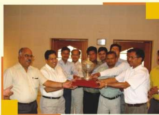
The Directors' Running Trophy being presented to the winning team of Jodhpur region