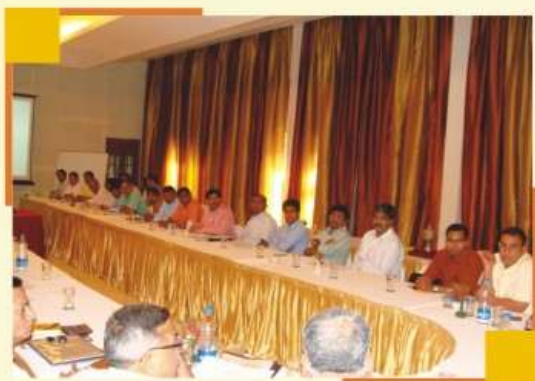
Deliberations going on during the Rajasthan marketing review session at Mt Abu

The entire exercise of organising the session at Mount Abu to have a right mix of "Business with pleasure" fulfilled its aim of refreshing the participants with motivation & confidence to go back to their area of work.