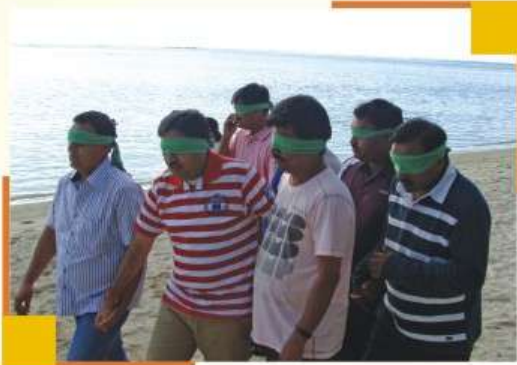
Management Games being played at the beach of Mauritius