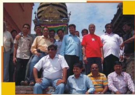
Team JK Lakshmiplast at a tourist spot in Kathmandu