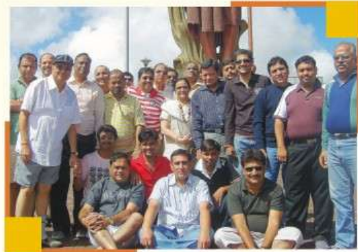
Team JK Lakshmi members at Mauritius